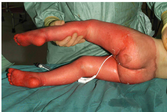
Fig. 3 – A case of intentional scald, showing bilateral lower limb and perineal/buttock involvement, clear upper margins and uniform depth.

Studies confirmed that children present with a combination of features and no single clinical feature can be used to distinguish intentional from unintentional scalds. We formulated a list of associated features into a prototype triage tool with the characteristics weighted by the strength of the evidence behind them. A previous study by Hight et al. [4] proposed a generic burn abuse triage tool. However, Hight, like many other studies, does not separate the physical features of scalds from other types of burns e.g. contact household burns or cigarette burns, nor does it differentiate between intentional and neglectful scalds. As the clinical features of both contact burns, and scalds due to neglect, are significantly different to those of intentional scalds [9,23,24], it is impossible to draw meaningful conclusions from such heterogeneous data. In addition, it was often unclear either how abuse was diagnosed or unintentional cause confirmed, further undermining many existing recommendations [4,7,19].