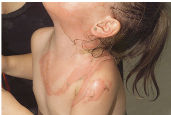
Fig. 4 – A case of accidental scald, caused by pulling down a hot liquid, showing irregular margins and variable depth.

There is no evidence to suggest that either the age or the gender of the child, or the TBSA affected, distinguished intentional from unintentional scalds. Although professionals experienced in paediatric scald management may feel confident dating a scald, there are no published studies within the peer reviewed literature to validate this practice. Therefore the comment that a “burn is older than the history given” cannot at this stage be scientifically substantiated, and cannot be included in a triage tool. We could not validate delayed presentation of the child with a scald as an indicator of intentional scalds. It is a feature that must be carefully assessed as it may otherwise reflect parental underestimation of the burn severity initially, difficulties in accessing care or inadequate first aid provided in the home [32].