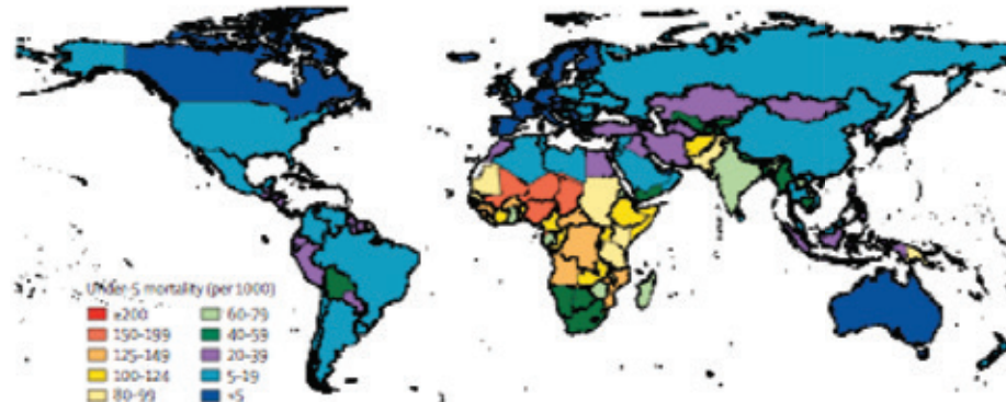
Figure 9-1: Under-5 Mortality, 2010